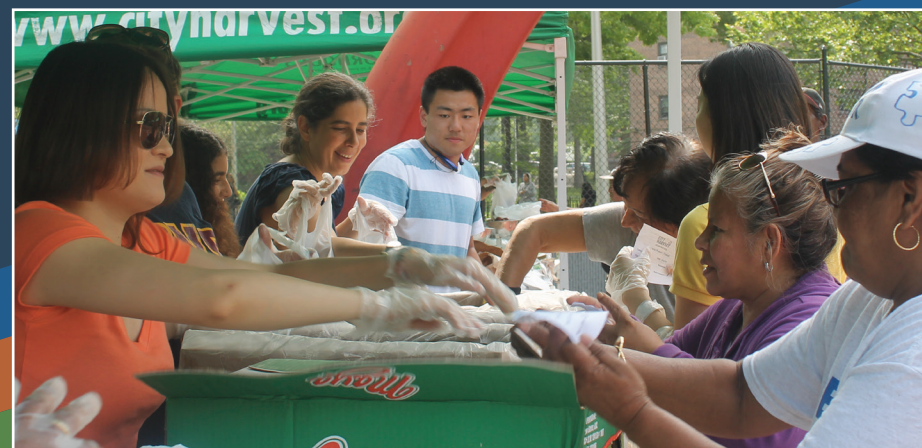
City Harvest hosts One To World volunteers to distribute fresh produce in Astoria, Queens.

“Volunteering in the soup kitchen was an awesome experience. Because of One To World, I gained a fuller appreciation for the reality of those who are homeless and a more well-rounded perspective of New York City.”