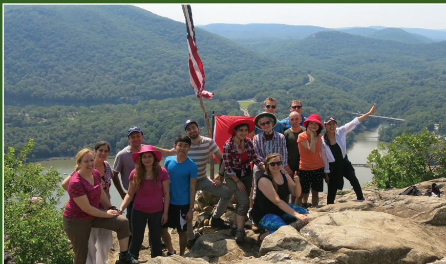
Students and scholars enjoy a day of hiking along the Appalachian Trail in Westchester County, NY.