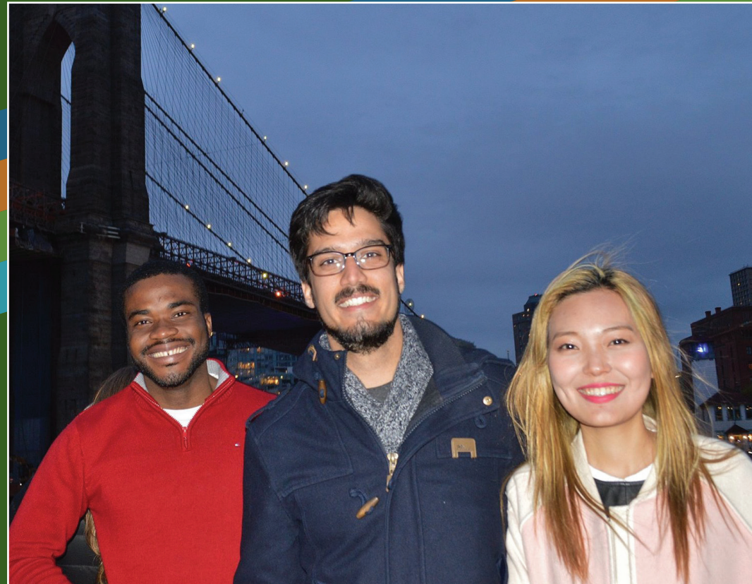
The One To World Twilight Cruise is a highlight of the year's social calendar, bringing together over 500 international students to celebrate the end of the semester while seeing the city from a unique perspective.

“One To World programs are like taking home with you a little piece of every single part of the globe even without having been there. That is priceless....”