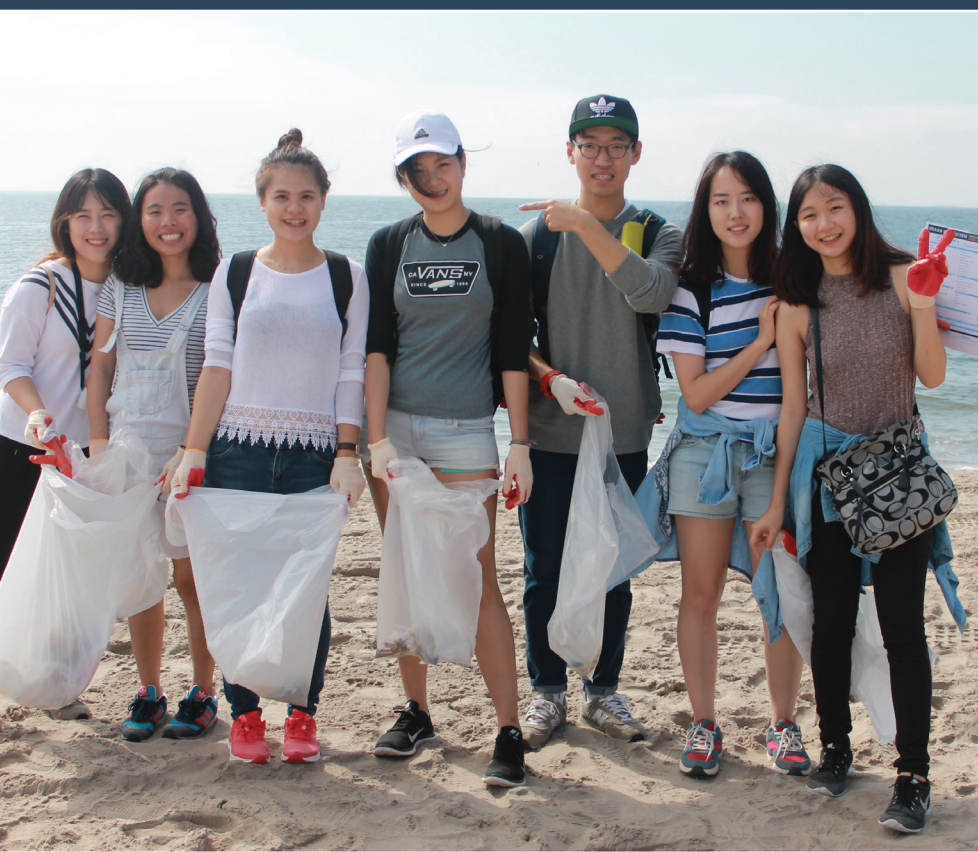
Cleaning up the beach at Coney Island, One To World volunteers enthusiastically embrace the American service tradition.