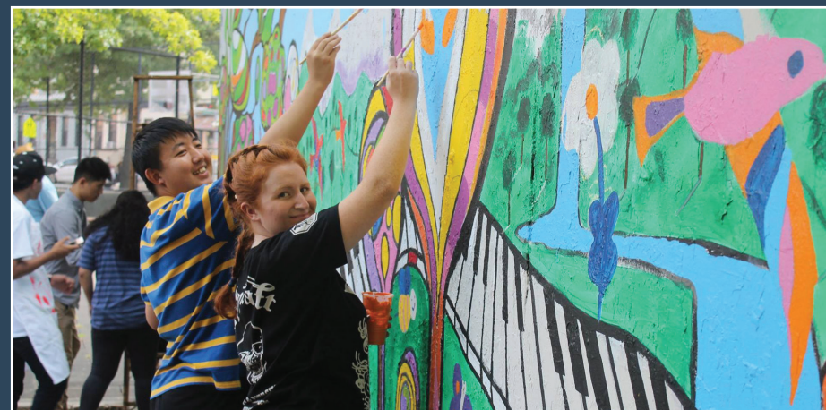
One To World joins local youth and professional artists in Bushwick, Brooklyn, partnering with CITYarts, which transforms communities through public art.