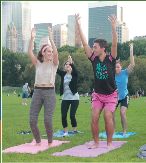
International students and scholars come together for One To World's Yoga in Central Park.

One To World SOCIAL GATHERINGS throughout the year introduce students and scholars from more than 100 countries to each other and to Americans, building relationships that span the globe and last a lifetime.