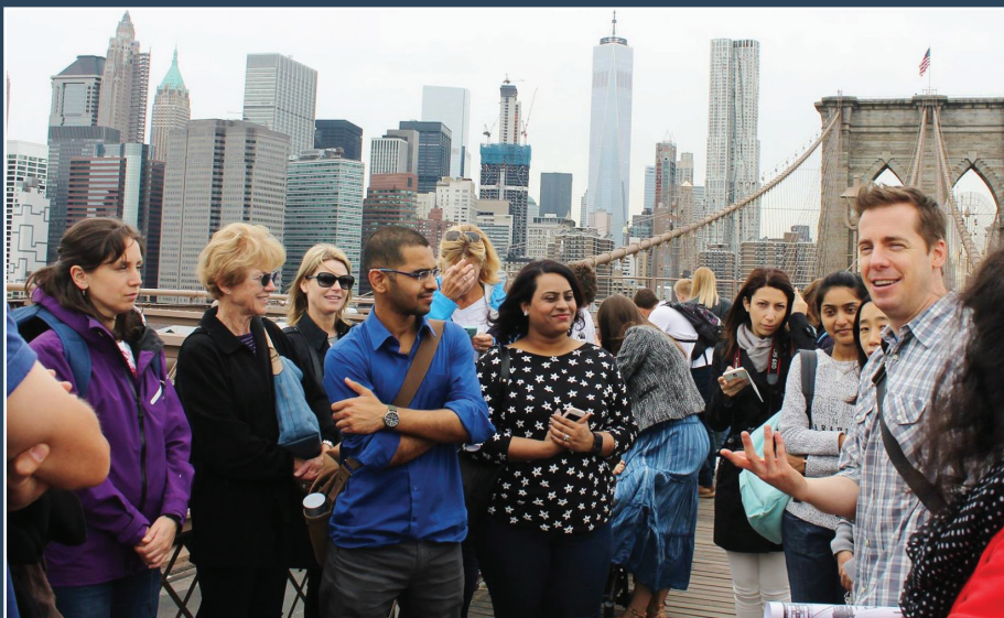
One To World offers a full schedule of behind-the-scenes looks at neighborhoods and institutions throughout the year.