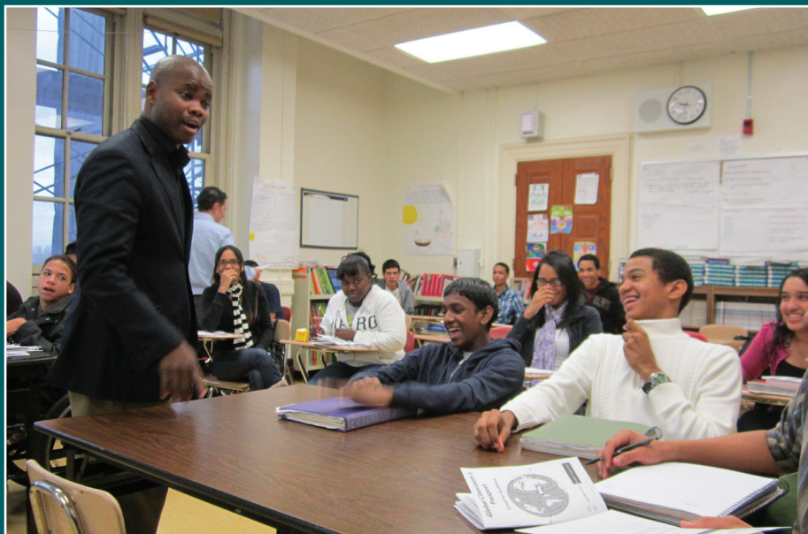
A Global Guide from Nigeria shares the history of uprisings in his country in the 1960s, bringing to life a class on political revolution for 10th grade public school students.