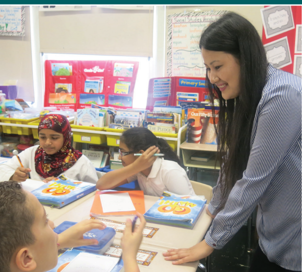
A Global Guide from Kazakhstan teaches about the shrinking Aral Sea during a 4th grade class on Sustainability.

“ Global Classroom was a new experience that opened my mind up to the world. We learned more than what we see in everyday media and textbooks. I love learning about new countries and the daily life of people outside the United States. No matter what country we live in, we are somehow connected.”