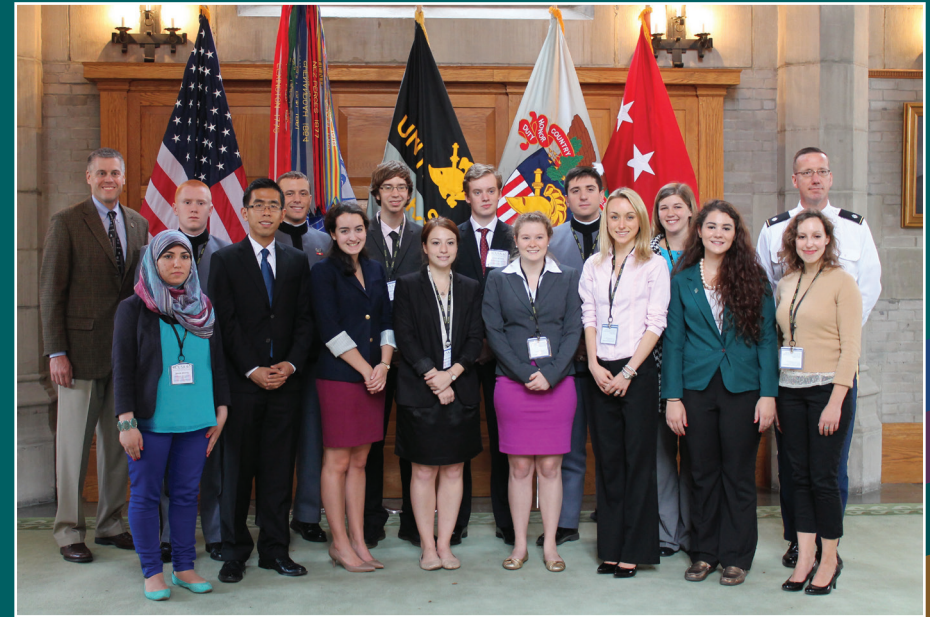
One To World's delegation shares international perspectives with top undergraduate students from across the United States.