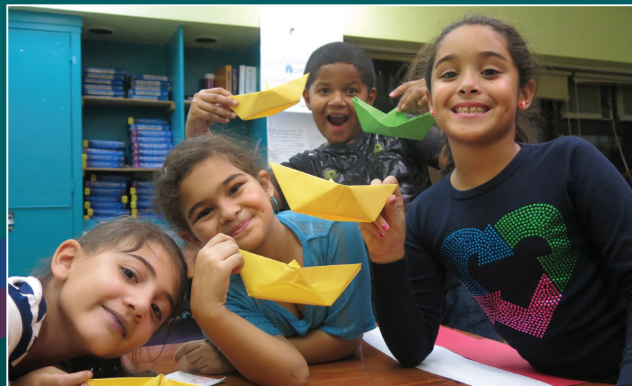
Exploring the cultural importance of water in Indonesia, elementary school students construct paper boats at the Beacon Community Center afterschool program.

In the 2014-15 academic year, Global Guides from 77 countries delivered 372 workshops to 615 unique students throughout Manhattan, Brooklyn, the Bronx and Queens.