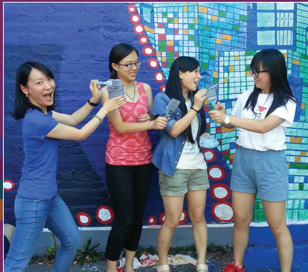
With CITYarts, students give back to New York City by helping to transform communities through public art projects with local youth and professional artists.

“It was eye-opening to see another side of NYC that is a long way from the touristy or glamorous aspects of the city. It was a great experience and I'm really glad I signed up to volunteer.”