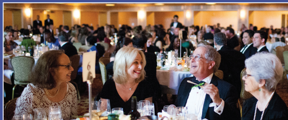
2015 Fulbright Awards Dinner.