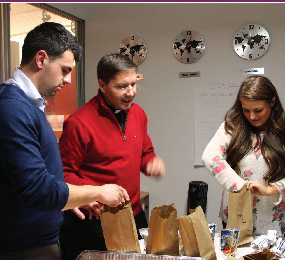
Helping to feed the homeless with Midnight Run allows students and scholars to engage in the American service tradition.